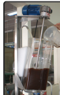
Dividing pulp slurry prior papermaking