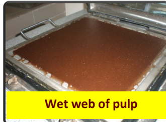
Wet web of pulp

0830-1030: THEORY OF STOCK PREPARATION 1030-1045: Refreshment 1045-1230: PRACTICAL OF BEATING AND DETERMINATION OF PULP FREENESS 1230-1400: Lunch break & Zohor prayer 1400-1600: THEORY OF PULP TESTING 1600-1630: Refreshment 1630 : End of day 2