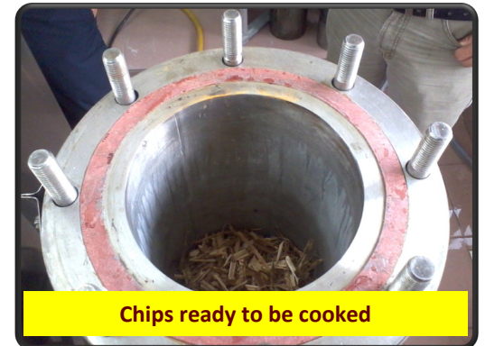
Chips ready to be cooked

0830-1030: THEORY OF PAPERMAKING 1030-1045: Refreshment 1045-1245: PRACTICAL OF PAPERMAKING 1245-1400: Lunch break & Zohor prayer 1400-1600: TEST & REVISION 1600-1630: Presentation of certificates and closing remarks by Head of laboratory, BADs 1630-1700: Refreshment 1700 : End of workshop